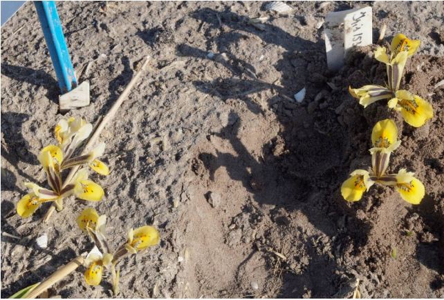
Orange Glow (98-00-1)

other thing to keep in mind: I think it is important to be measuring flowers from similar sized bulbs. The key point though, is the tetraploid flowers were definitely larger.