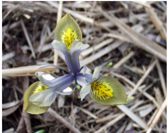
89-A-3 hyrcana x danfordiae

We love pure species, but sometimes those species are very difficult to keep in our gardens. This is where a little hybridizing can help to make plants that are more robust. A few people are not happy. They want only plants that are found in nature. Everything else is an abomination! It may be that those people thrive on the challenge of growing things that are difficult. If the average person tries something and it does poorly, they’re simply going to give up: case in point Iris danfordiae “shatters” after 2 years.