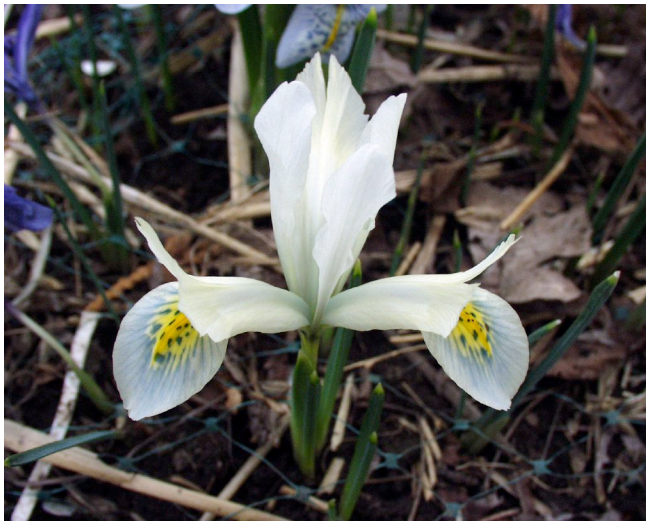
92-FB-1 Cantab x winogradwii

92-FB-1 and 89-A-3 no longer exist, but were sterile diploid dead-ends. I did think 92-FB-1 was quite nice, and would have loved to have seen what hybrids could have been created using it at the tetraploid level.