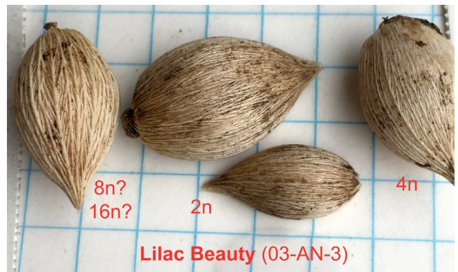
Lilac Beauty (03-AN-3)

Keep in mind that although tissue culture is being used to increase the polyploid stock, doing so is 1) expensive, and 2) not that effective (meaning you don't shave that many years off getting to market). It might be different if you had a variety that was going to be in high demand at good prices, and all the kinks were worked out of the delivery process